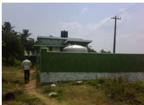
ARWSS Parali – Idling water treatment plant

Thus all the three test-checked Panchayats lacked access to safe drinking water as envisaged in ARWSP, as there were no comprehensive water supply schemes.