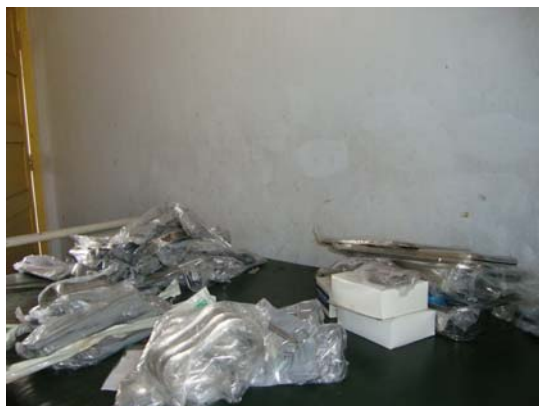
Idling surgical kits – (1) CHC, Agali

The DMOH stated (October 2011) that the supply was not against the indents from the institutions and surplus stock had not been transferred to other institutions as there was no request from them. The DPM stated (January 2011) that the kits were not utilised for want of specialist doctors in the respective hospitals. Evidently, the purchase was made without assessing the actual requirement or ascertaining the demands from the hospitals/centres concerned.