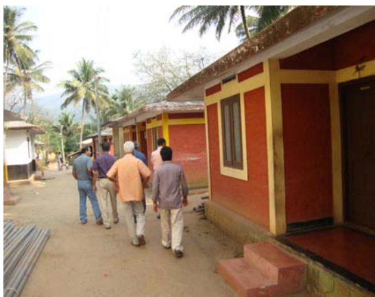
Completed houses –Model –Chemmanur Hamlet (Phase - I)

It was stated by AHADS (March 2011) that the shortfalls in achievement were due to lack of skills among the tribal people in civil engineering works, difficulty in accessing various interior hamlets during the rainy season, non-availability of building materials and skilled labour. The expenditure on the incomplete houses amounted to ₹ 28.73 crore.