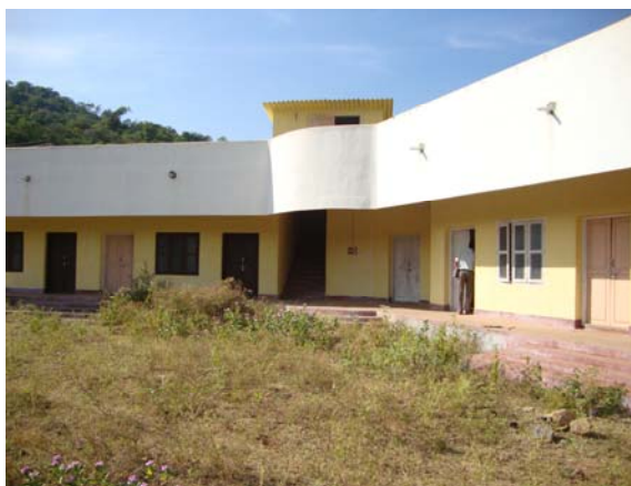
Building for Government Upper Primary School, Thazhemully