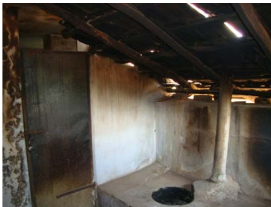
ALPS, Kinavallur- Kitchen adjacent to Toilet

The Project Officer stated (October 2011) that the matter of not having a pucca kitchen in ALPS, Kinavallur was intimated to the Assistant Educational Officer for immediate action. This indicated that improvement of infrastructure in the aided schools which was to be done by the Manager concerned, was not ensured by the educational authorities.