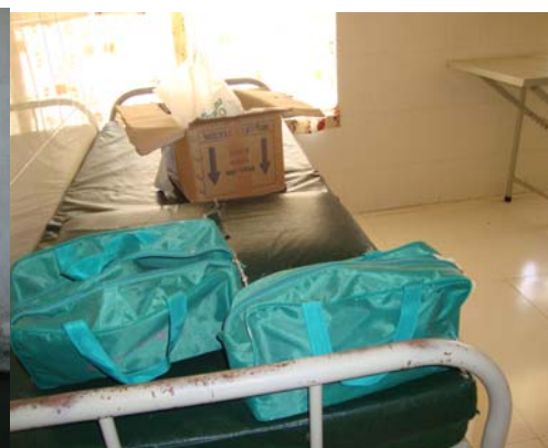
(2) GTSH, Kottathara